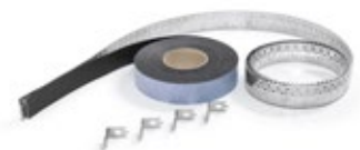
ArmaProtect EFC1 & EFC2 Endless firestop collar