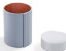
ArmaProtect CT Firestop cable tube