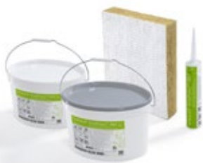
ArmaProtect CB Coated firestop board (includes ArmaProtect ABLC Firestop coating and ArmaProtect ABLF Firestop filler mastic)