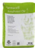
ArmaProtect CM Firestop mortar