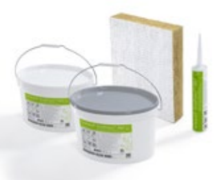
ArmaProtect CB Coated firestop board (includes ArmaProtect ABLC Firestop coating and ArmaProtect ABLF Firestop filler mastic)