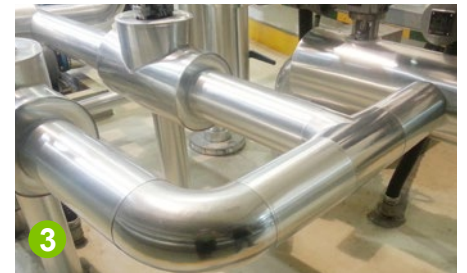
1 Lenzing Group's fibre plant in Austria