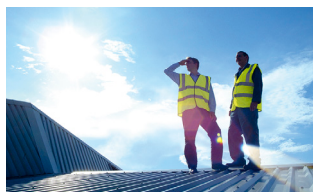
Easy to install