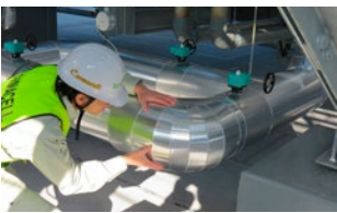
Excellent weather resistance