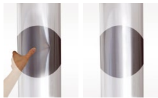
Resistant to deformation