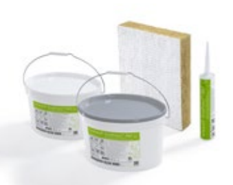
ArmaProtect CB Coated firestop board (includes ArmaProtect ABLC Firestop coating and ArmaProtect ABLF Firestop filler mastic)