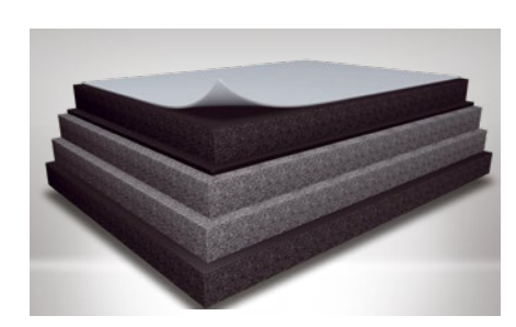
Use alone or as part of a system