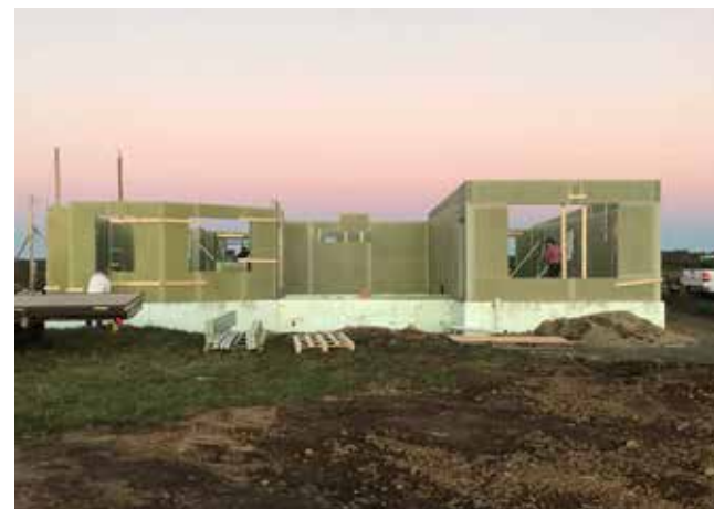
Eco-friendly house consists of 170 ArmaPET Struct cored SIPs, assembled in 14 hours.

The build also came together very quickly. The entire 2,000-square-foot structure consists of around 170 panels, each designed for a different position. The panels were manufactured by three people in three weeks and the assembly itself was completed within 14 hours!